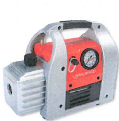
ROAIRVAC 1.5 (42 l/min)