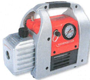
ROAIRVAC 6.0 (170 l/min)