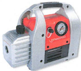
ROAIRVAC 3.0 (85 l/min)