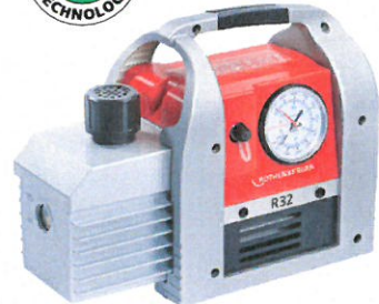
ROAIRVAC R32 6.0 (170 l/min)

Future-proof product for the increased use of R32 refrigerants