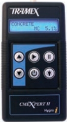
Product order code: CMEX2

The Hygro-i® probe is used with the CMEX II or the MRH III for relative humidity testing of flooring slabs and ambient conditions.