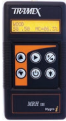
Product order code: MRH3